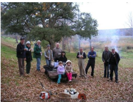
Low bench and cork oak