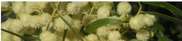
Acacia implexa – Lightwood