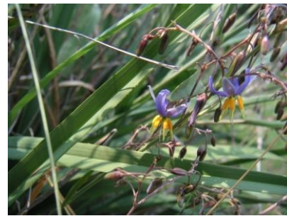
Dianella admixta or Dianella sp. aff. longifolia (Benambra) - remnant native vegetation in Area 4 of Wybejong Park.

Photograph, above, taken in November 2019 of our May 2018 planting. This area had a widespread periwinkle infestation. It was sprayed out twice, earth moving machinery was contracted to sift the soil, add rocks and rearrange the hillside ready for planting and fencing.