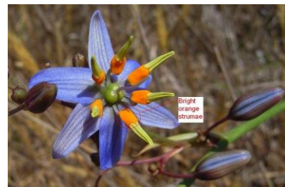
Dianella amoena —a rare plant that occurs along the railway line in Riddells Creek and along Sandy Creek. We have planted it upstream in our spring 2007 and 2008 plantings.