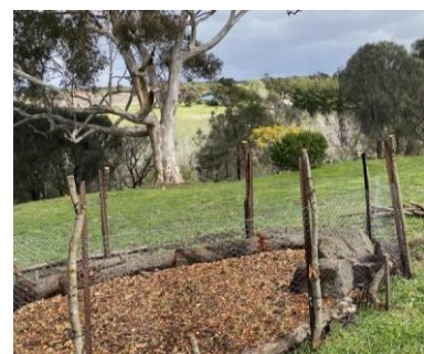
Murnong Patch, Microseris scapigera . work in progress 2021.